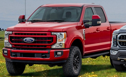
FORD SUPER DUTY

ON ELIGIBLE NEW SUPER DUTY®, F-150, RANGER OR MAVERICK